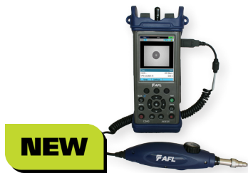
C860 with DFS1 Digital FiberScope